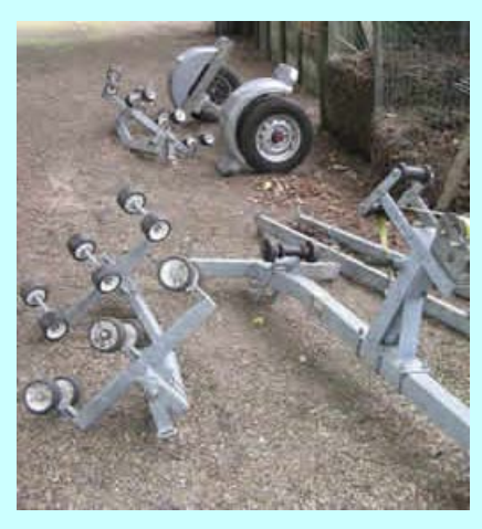
Boat trailer, suitable for 5.3-6M RIB.

Currently partly disassembled to allow removal as brake on one wheel will not release.