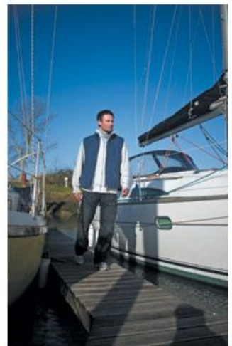
All colours and sizes are for guidance only